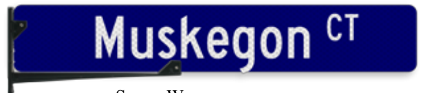
SMALL WING SHOWN WITH 36" X 6"

SIGN NOT INCLUDED IN PRICE, SEE PAGE 11 FOR OPTIONS