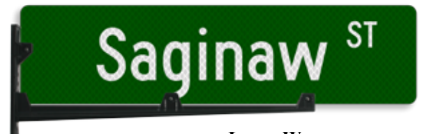
LARGE WING SHOWN WITH 42" X 9"

In addition to being mounted to our standard posts, Wing Brackets can also be fastened to walls, concrete, wood or existing posts with 3/4" strapping bolts, lag screws or spikes. Provide us with information on your mounting application and we can send a hardware package that suits your needs. Additional costs for hardware and fasteners may apply.